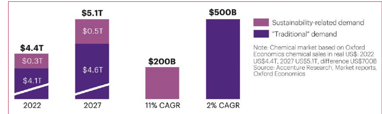
Fig. 1: Projected demand for sustainability-related chemical offerings.

• Ensure access to sustainable feedstocks. There is a shortage of the