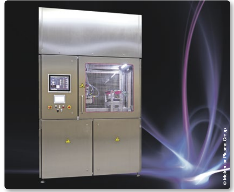
Molecular Plasma Group's PlasmaLine 300 - R&D System.