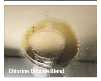
Figure 2: The build-up of residue of different cleanroom disinfectants on a surface. Mirrors were used to show residues more easily.

In order to define this for a cleanroom disinfectant used in Contec's own cleanrooms a cleaning phase was carried out at each stage of the residue build up work. When the disinfectant was sprayed onto the surface for four weeks, the salt residue was visible from week 2. Previous studies had shown that the residue could easily be removed immediately after use with both water and IPA. We wanted to validate that we could use the product without a residue removal stage for a month, so work was carried out at intervals to see if the residue remained free-rinsina.