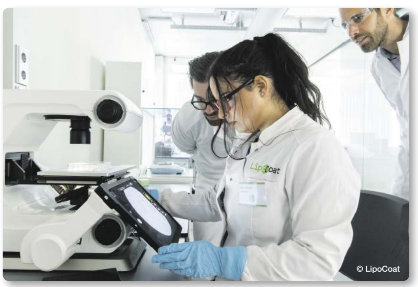
LipoCoat's headquarters are located at Kennispark Twente in Enschede, the Netherlands, across from the University of Twente campus, where the company also built its own lab facility.

As of April 2021, the company has raised €4.1 million in total (combination of equity and non-dilutive funding). LipoCoat is always interested in establishing new alliances and partnerships to leverage their strengths: identifying novel applications, expanding the understanding of microbiology, and developing new substrate solutions with innovative modes of action that impact health care and well-being.