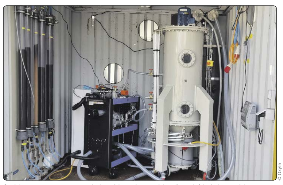
Oxyle's wastewater treatment platform (shown is one of the pilot units) includes modular reactors, nanoporous catalysts, and real-time monitoring services powered by clean energy sources.