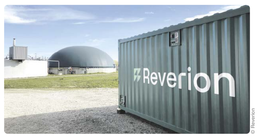
Reverion's micro power plants enable a highly flexible and efficient decentralized energy supply.

What impact does your product/ solution have on the energy transi-