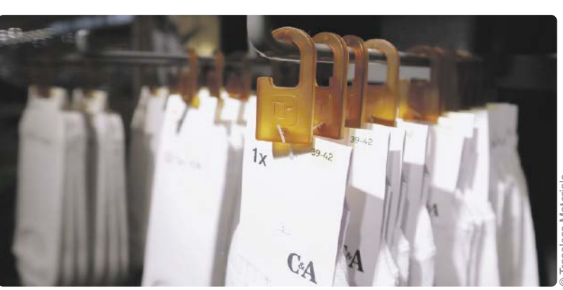
Traceless provides a natural and biocircular alternative to conventional plastics.