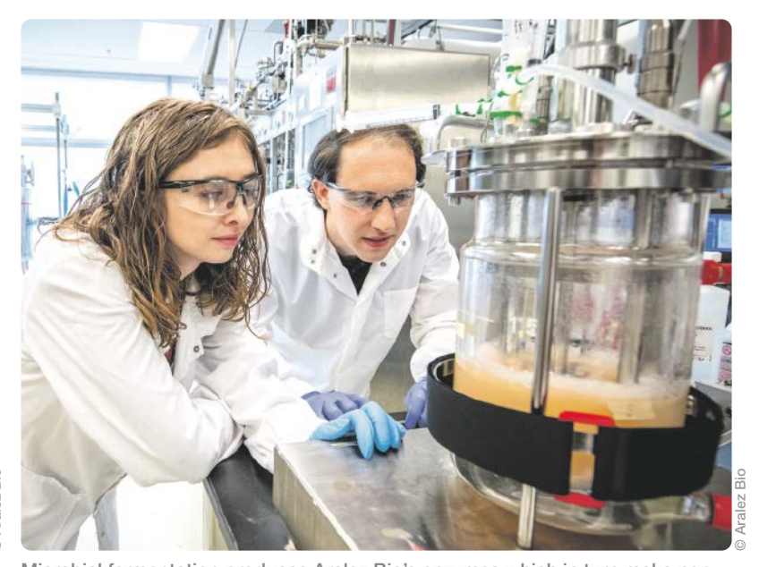
Microbial fermentation produces Aralez Bio's enzymes which in turn make noncanonical amino acids.

A comparison of Aralez Bio's platform to the conventional production process of noncanonical amino acids.